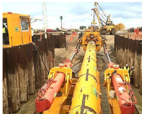
Plate 3.4: Direct pipe thruster equipment at the landfall compound