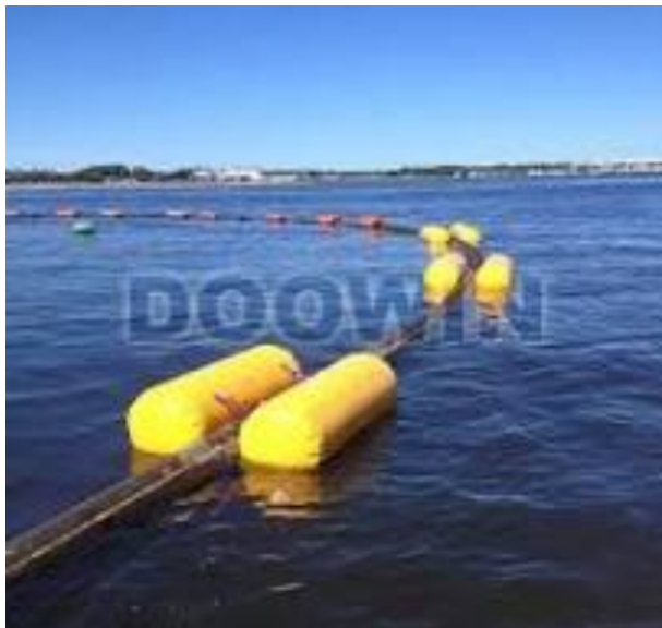
Plate 3.8: Typical Cable Floats

3.14.5.7 The offshore export cables would then be floated between the cable lay vessels and the intertidal area using cable floats ( Plate 3.8 ). The cable floats support the cable pull-in and cable catenary until it reaches the cable roller boxes on the beach.