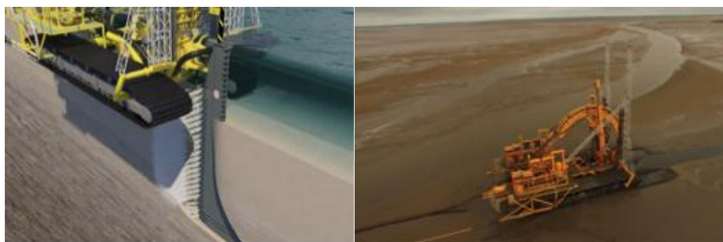
Plate 3.9: Example Cable Trenchers