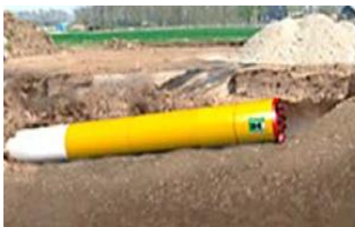
Plate 3.5: MTMB machine at exit location