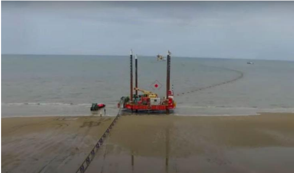
Plate 3.7: Example intermediate pulling platform barge

3.14.5.7 The offshore export cables would then be floated between the cable lay vessels and the intertidal area using cable floats ( Plate 3.8 ). The cable floats support the cable pull-in and cable catenary until it reaches the cable roller boxes on the beach.