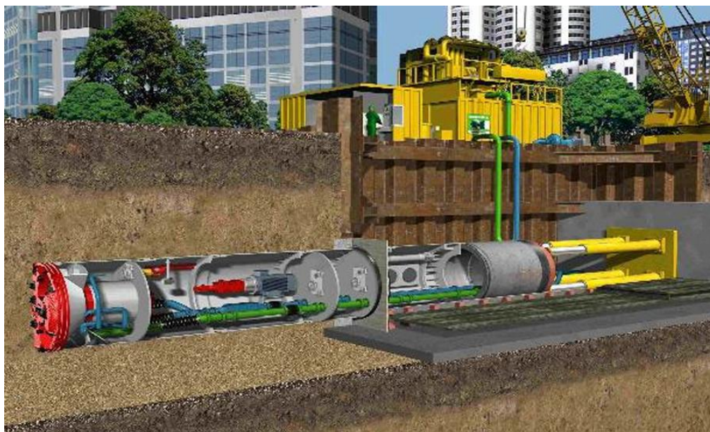
Plate 3.10: Indicative micro-tunnelling schematic

with a bentonite slurry in the cutting chamber and is transported to the surface by pumps via inlet slurry and return slurry lines installed within the concrete pipe string. See Plate 3.10 for an indicative schematic.